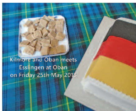
Kilmore and Oban meets Esslingen at Oban on Friday 25th May 2018