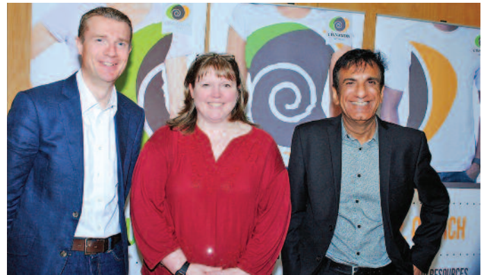
Cinnamon Trust Team