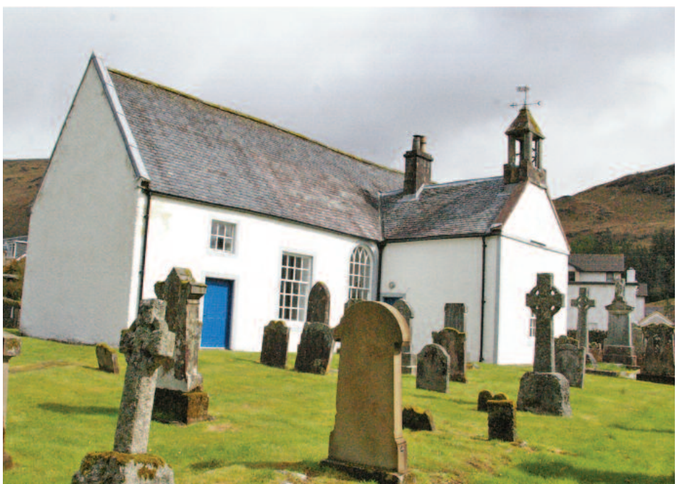
Lochgoilhead Parish Church