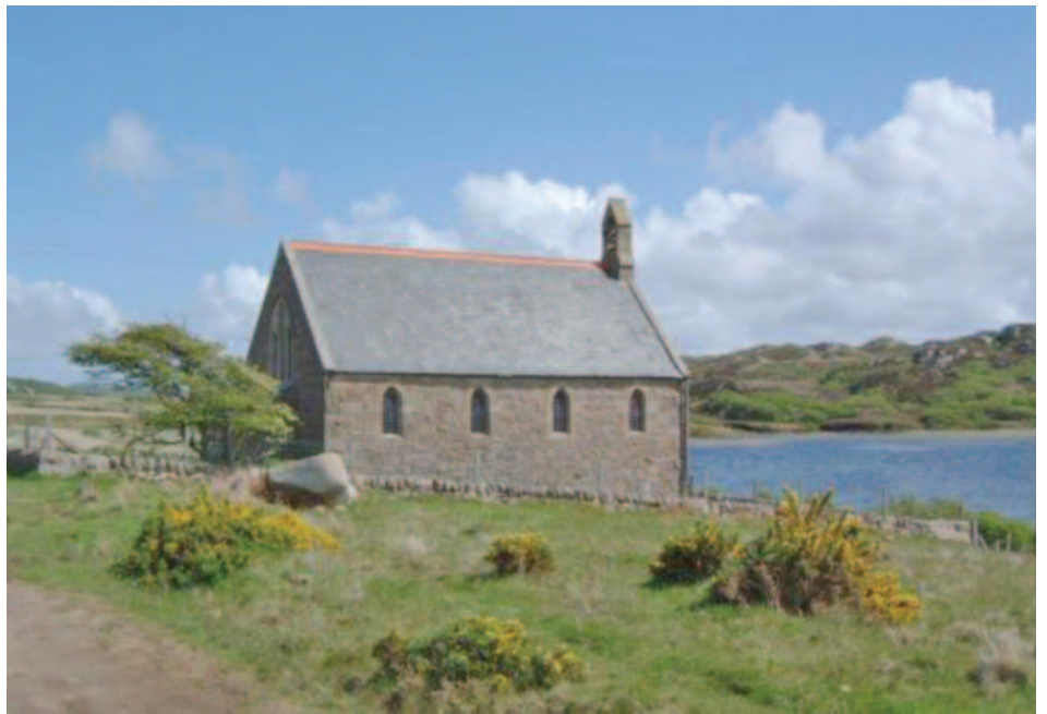
Creich Church, Mull